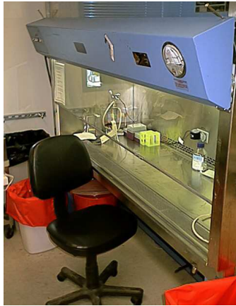
Figure 1: A hood in one corner of Lab A.

As STS researchers have established previously [5, 13], we found in our study that BME research does not proceed down a neat and orderly trajectory as in the idealized model of “The Scientific Method.” In the real laboratory, experimental practices are not stable and hypotheses are rarely well formed at the start of a research project. However, this characterization of scientific practices does not seem to have made it much beyond these social science fields and so we to briefly address it here.